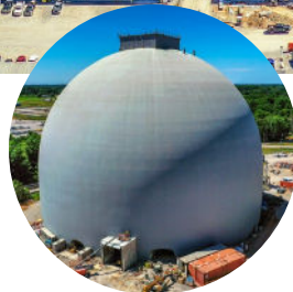
Lehigh Cement's dome in Indiana can store 169,000 metric tons of clinker.