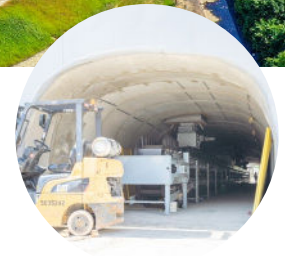
A high water table required the three tunnels be built at grade.