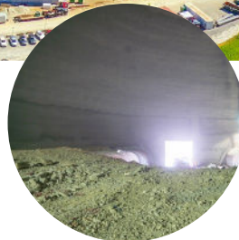
Structural backfill surrounds on-grade tunnels, and the top is layered with clinker, which functions as the dome "floor."